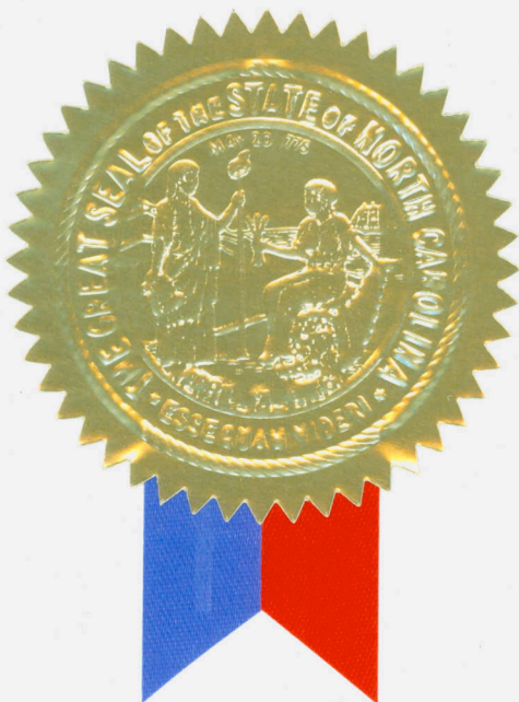
BEVERLY EAVES PERDUE

NOW, THEREFORE, I, BEVERLY EAVES PERDUE, Governor of the State of North Carolina, do hereby proclaim May 6, 2010, as a " DAY OF PRAYER " in North Carolina and urge our citizens to join together in their homes, places of work and places of worship, to pray for the unity of the hearts of all mankind, and to continue in prayer for our State and our Nation.